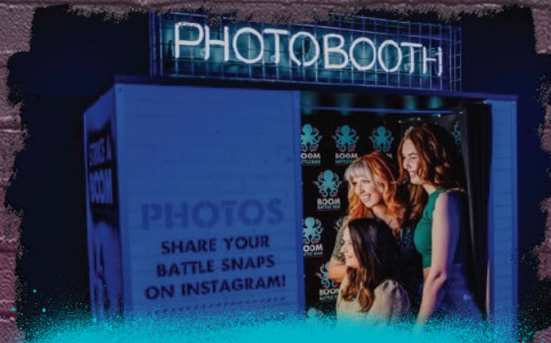
ADD ON AND PERSONALISATION OPTIONS