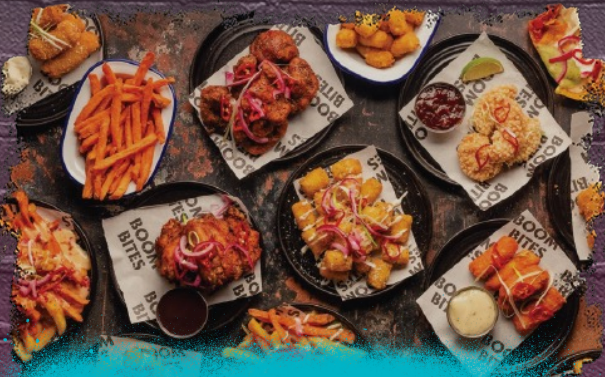
DELICIOUS SHARING-STYLE STREET FOOD