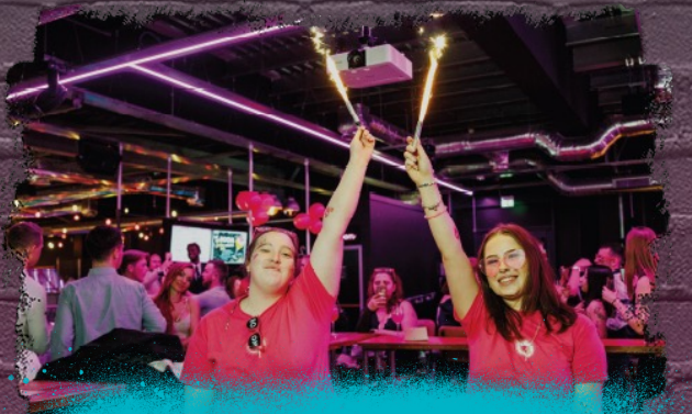
END TO END ORGANISATION BY PARTY PROS