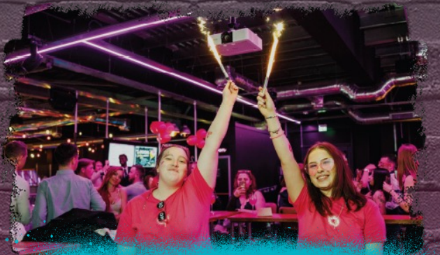
END TO END ORGANISATION BY PARTY PROS