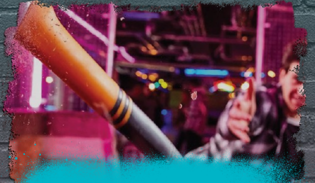
ADRENALINE PACKED GAMES