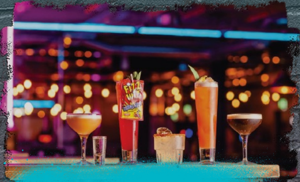
INSTA-WORTHY COCKTAILS AND DRINKS