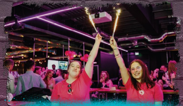
END TO END ORGANISATION BY PARTY PROS