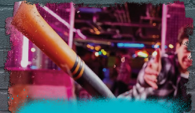
ADRENALINE PACKED GAMES