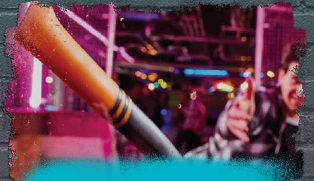
ADRENALINE PACKED GAMES