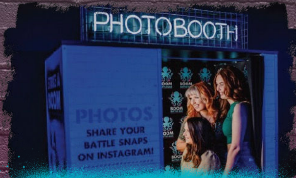
ADD ON AND PERSONALISATION OPTIONS