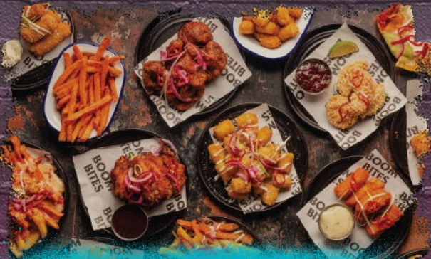
DELICIOUS SHARING-STYLE STREET FOOD