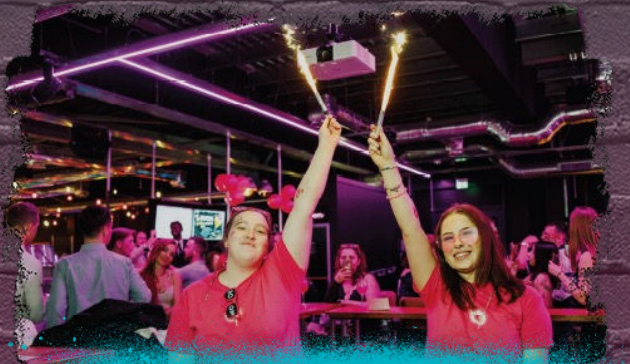
END TO END ORGANISATION BY PARTY PROS