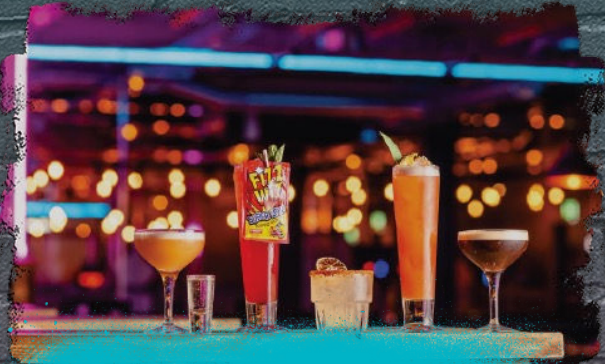
INSTA-WORTHY COCKTAILS AND DRINKS